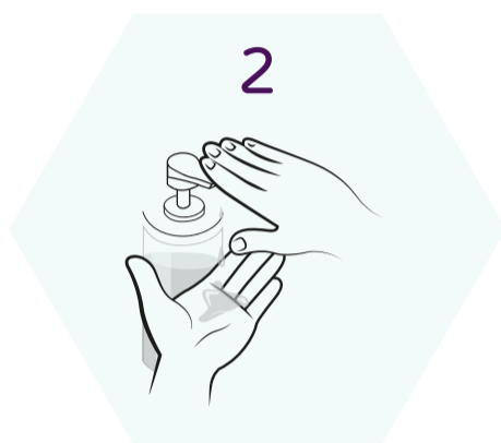
2 Apply enough soap