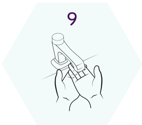
9 Rinse hands with water