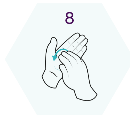
8 Rotational rubbing, backwards and forwards with clasped fingers in your palm