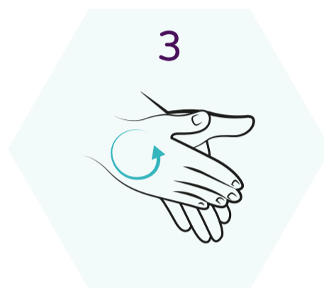
3 Rub hands palm to palm