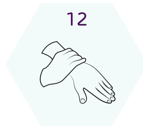
12 ... and your hands are safe