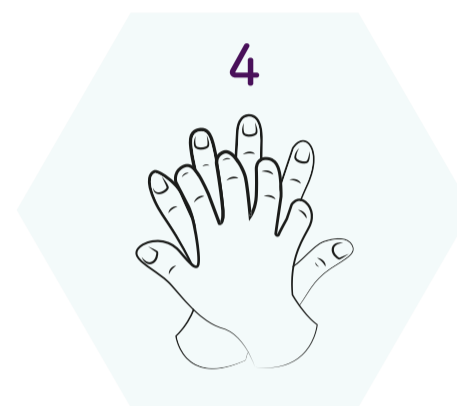
4 Right palm over left dorsum with interlaced fingers and vice versa