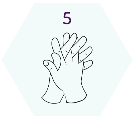
5 Palm to palm with fingers interlaced