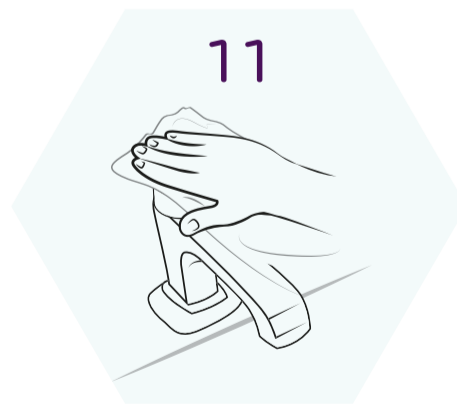
11 Use the towel to turn off the faucet