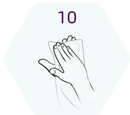
10 Dry thoroughly with a single use towel