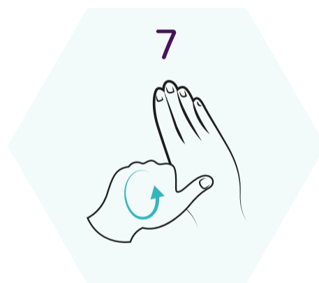
7 Rotational rubbing of thumb clasped in your palm